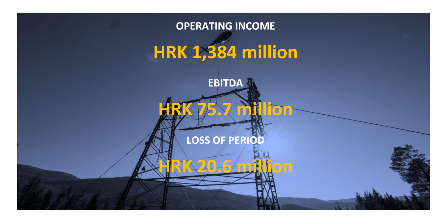
OPERATING INCOME, EBITDA, AND NET PROFIT DALEKOVOD D.D. (I-XII / 2021)